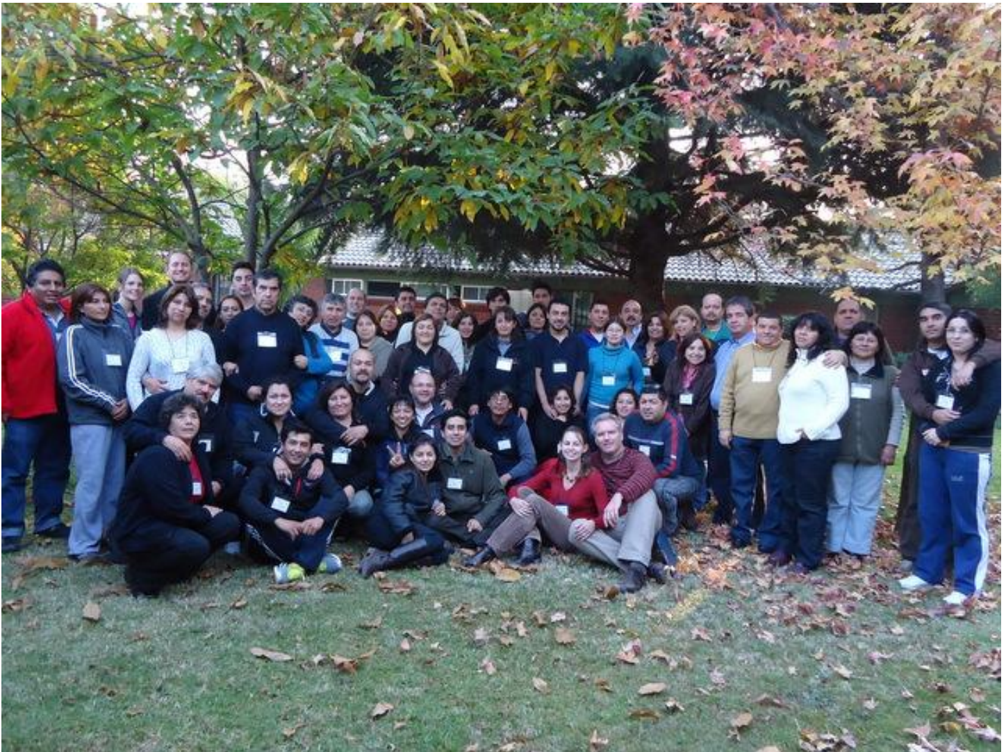
Twenty married couples attended Ágape 13.