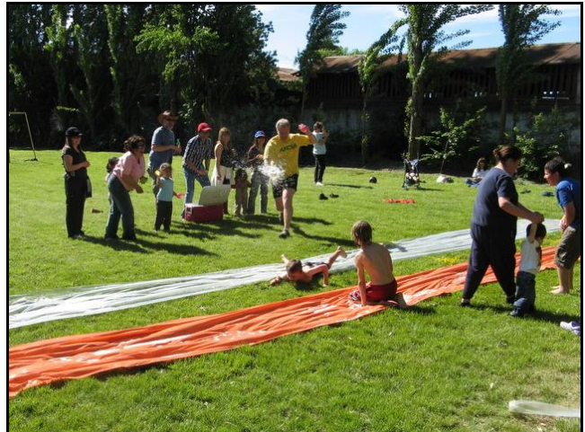
A homemade "Slip 'N Slide" and tons of water balloons made Saturday's free time especially memorable.