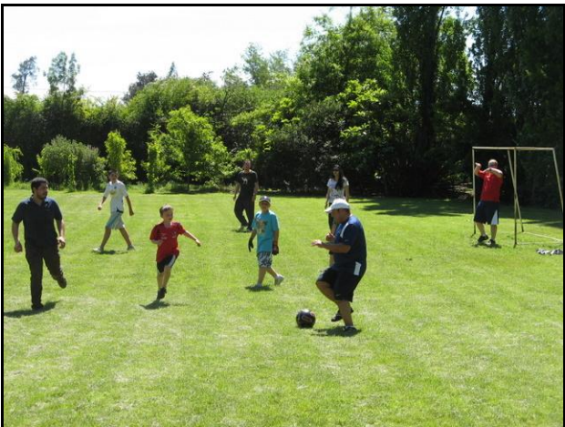
More free-time recreation