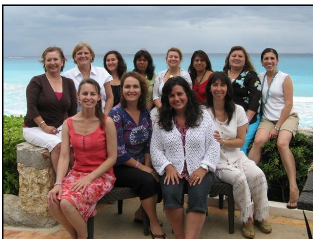
The group comprised 12 from Mexico, the US and Chile.