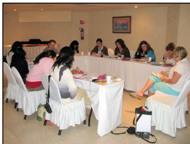
The gospel of Mark was our text for the week.