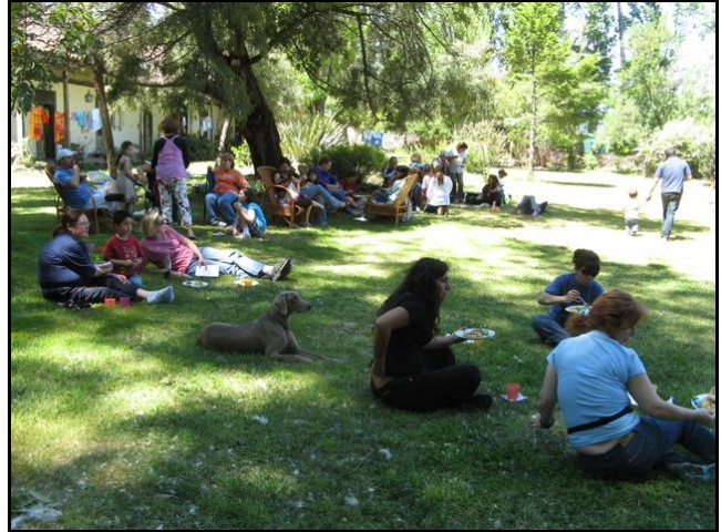
Lunch on the lawn