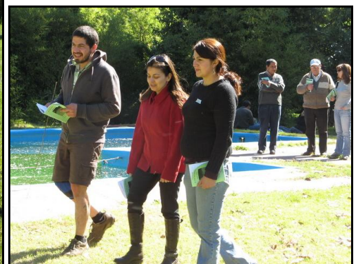
Groups of three walk and share

Because the groups were different each time, church members got to form new bonds as well as strengthen already established relationships. Perhaps the best part of the retreat was that of the 75 or so in attendance, the vast majority