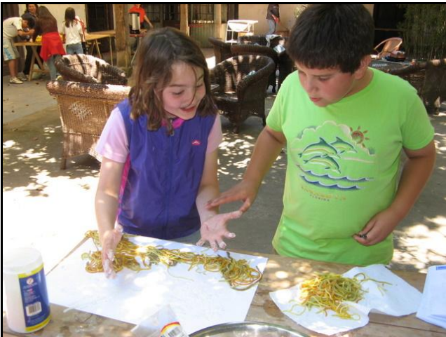
Kids' activities included an "Amazing Race": this event required teams to depict The Flood using only spaghetti, shredded coconut and glue!