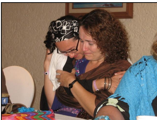
The last day, women shared the gospel's application to their lives.