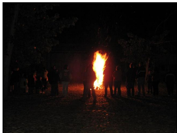
Tradition calls for a bonfire on the last night of the retreat.